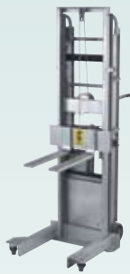
DC-66 with WLF Option