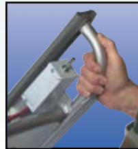
DC-66 with WLF Option