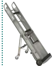
KOW Kick-out Wheel