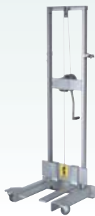
WLF Winch Lift Option