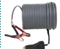
Battery Charger Cord