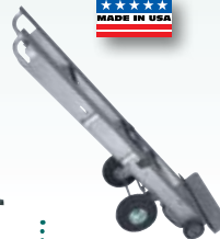
MSWK Superwheel Option