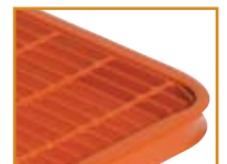
Close-up of grid deck